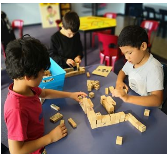
Building creations as part of P.B.L.