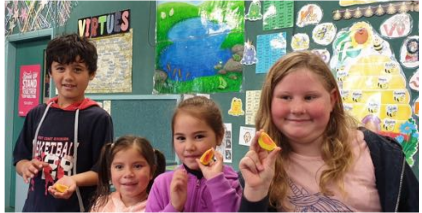
Baking for 'Kids in the Kitchen' day. Creating 'layers of the earth' as part of our science kit.