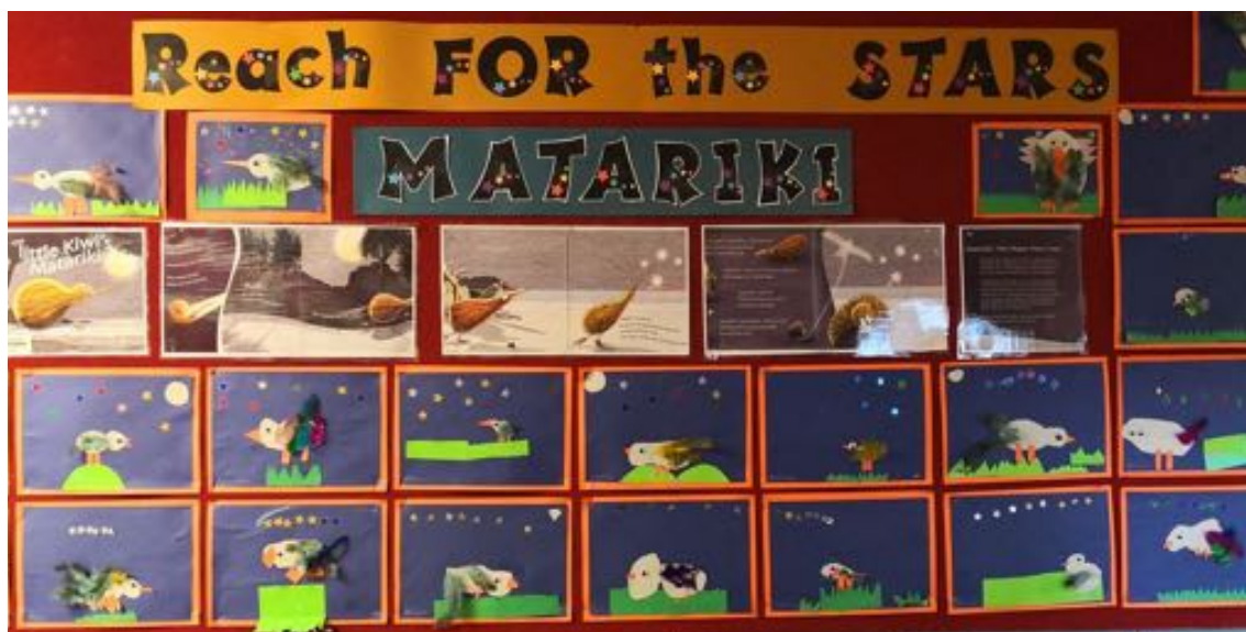
Our Matariki artwork based on the story 'Little Kiwi's Matariki'.